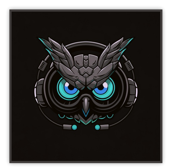
User Manual v3.0.3