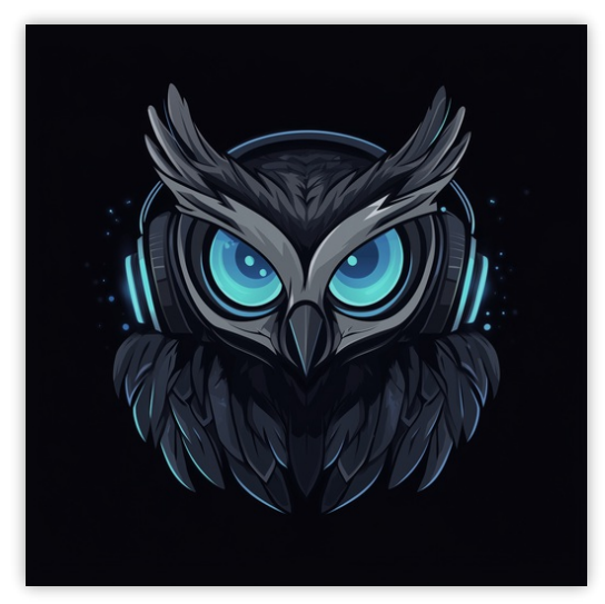
User Manual v3.2.1